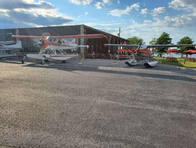
Value - $1,500 – includes up to 3 participants, pilot and flight in SW Ontario, full dinner with drinks, airport fees, circle of the CN tower weather permitting.